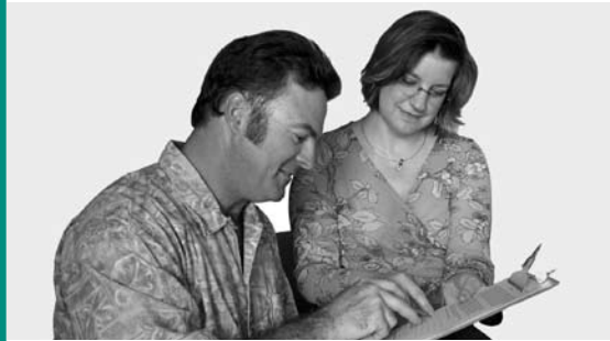
Zumbro Valley Mental Health Center works with numerous businesses to help people with a mental illness gain employment.

The Supported Employment Program provides a variety of job options, ranging from entry-level to skilled professional, to people with a serious mental illness. Our focus is to help you find and maintain a job in your community.